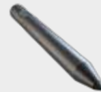
Moil point tool